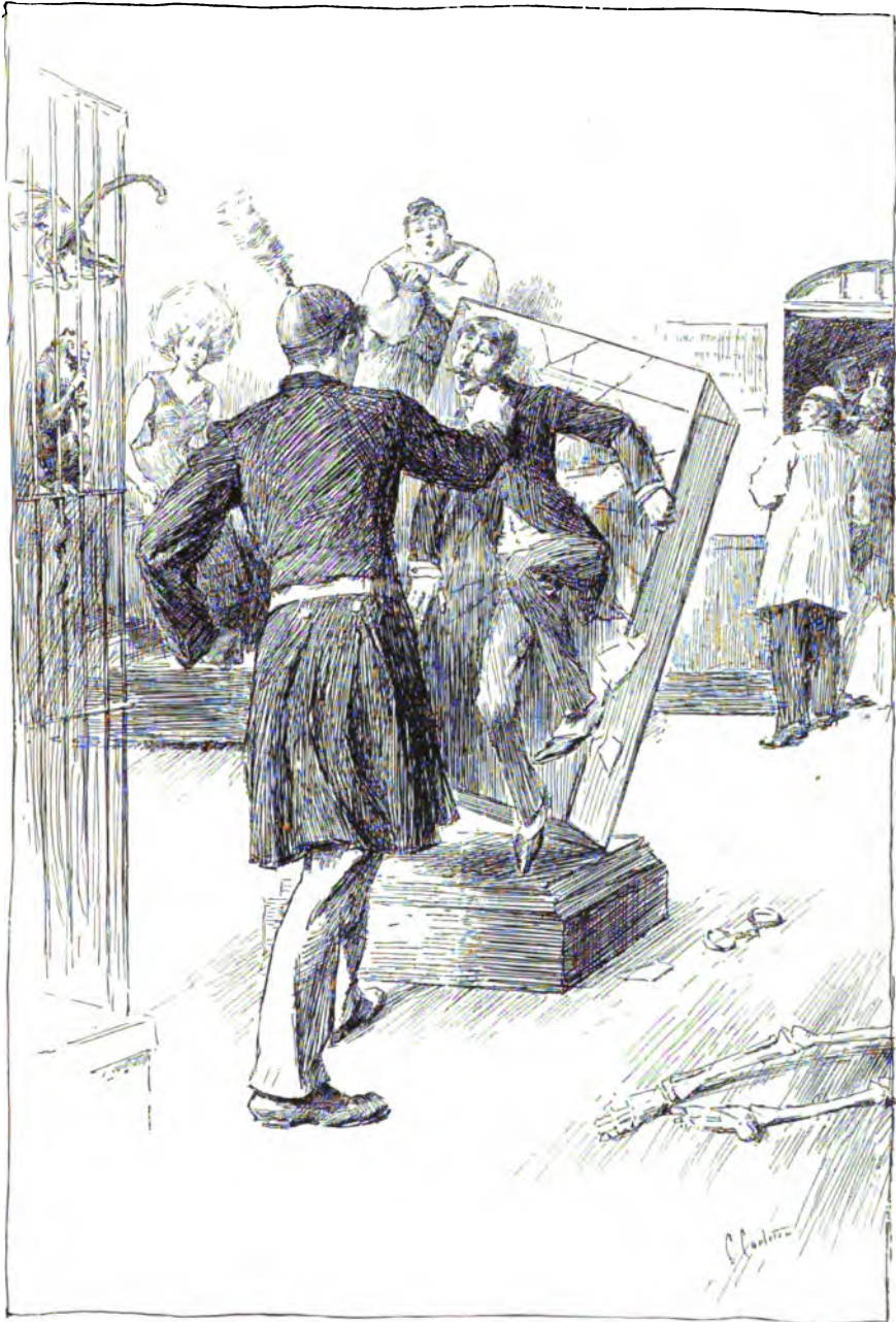
"I KICKED THE WHOLE ESTABLISHMENT WITH HIM."